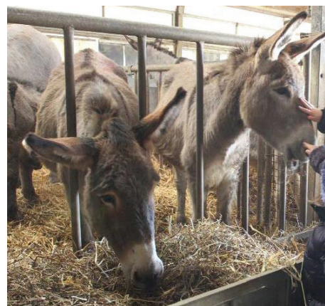
Figure 1: Donkey farming in European countries.

The jenny milk exceptionally having high nutritional benefits amongst other farming animals milk. Production of